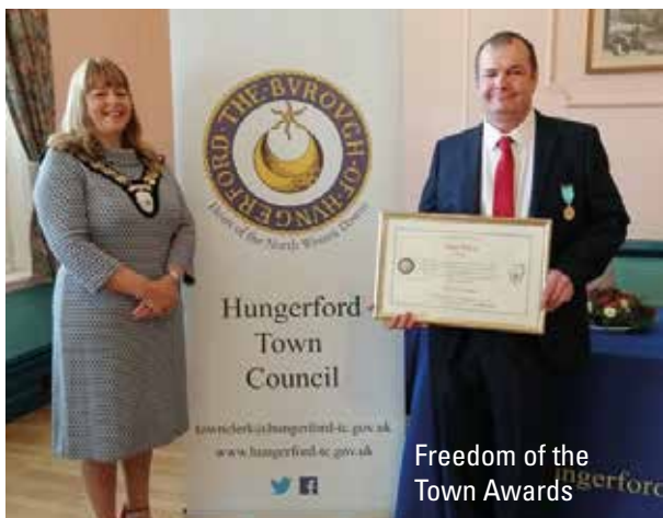
Freedom of the Town Awards

Currently we have two vacancies for councillors. If you are interested in joining please email townclerk@hungerford-tc.gov.uk . Our councillors are all from different walks of life and we are fortunate to have a mix of both young and old. We are keen for people to bring different views and skills to the table so don't hesitate to ring for a chat if you think you could help in any way.