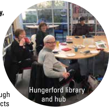
Hungerford library and hub

Covid has shown that local councils can respond effectively, efficiently and quickly to challenges. Our aim is to build on what we've learnt from this so as to be sure we're even better equipped to serve the town, in good times or in bad. Your input will be crucial to/for this – having read this brief summary, please let us know if there are other things you think we should be doing or any ways in which you can help.