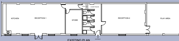
Croft Field Activities Centre plan

Leisure and well-being Understanding the needs of the community by promoting activities and events that support